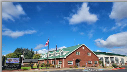
INDEPENDENCE/MONMOUTH CENTRAL STATION—STATION 90