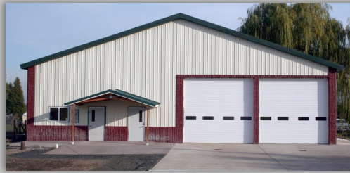
BUENA VISTA—STATION 40