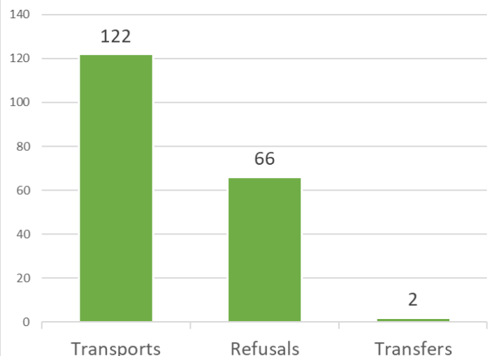
EMS Call Types